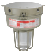
Ceiling w/ 5-1/2" Globe & Guard