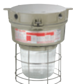
Ceiling w/ 7-3/4" Globe & Guard