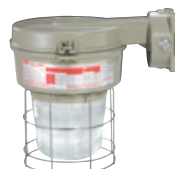
Wall w/ 7-3/4" Refractor & Guard