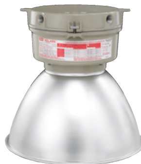
Ceiling w/ Enclosed Reflector