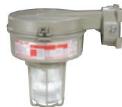
Wall w/ 5-1/2" Refractor & Guard