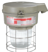
Stanchion 25° w/ 7-3/4" Globe & Guard