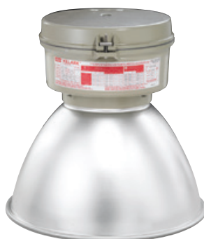
Pendant w/ Enclosed Reflector

Class I, Div. 2, Groups A,B,C,D ① Class I, Zone 2, Groups IIC, IIB, IIA Class II, Div. 1 & 2, Groups E,F,G Class III Suitable for wet locations NEMA 3, 4, 4X IP66