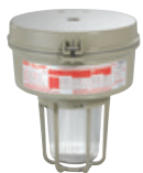
Pendant w/ 5-1/2" Globe & Guard