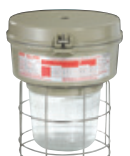
Pendant w/ 7-3/4" Globe & Guard