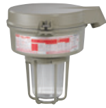
Stanchion 25° w/ 5-1/2" Globe & Guard