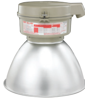
Stanchion 25° w/ Enclosed Reflector